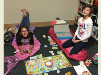
Board Games with Friends