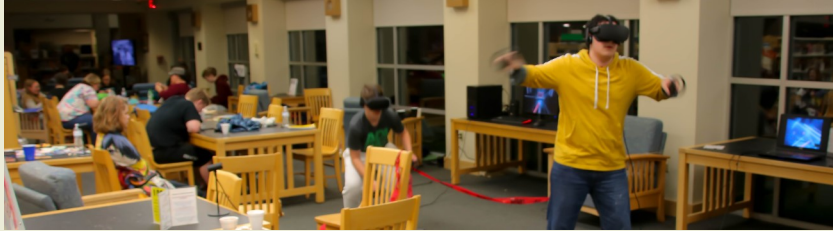
Virtual Reality Gaming