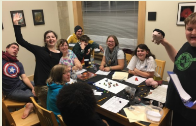
Dungeons & Dragon Campaign