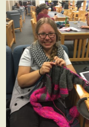
Knitting and Crochet